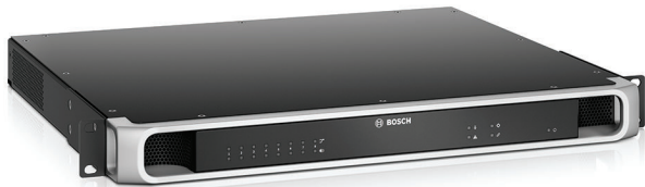
PRA-AD608 with 8 channels

This is a flexible and compact multi-channel power amplifier for 100 V or 70 V loudspeaker systems in Public Address and Voice Alarm applications. It fits in centralized system topologies, but also supports decentralized system topologies because of its OMNEO IP-network connection, combined with DC-power from a multifunction power supply. The output power of each amplifier channel adapts to the connected loudspeaker load, only limited by the total power budget of the whole amplifier. This